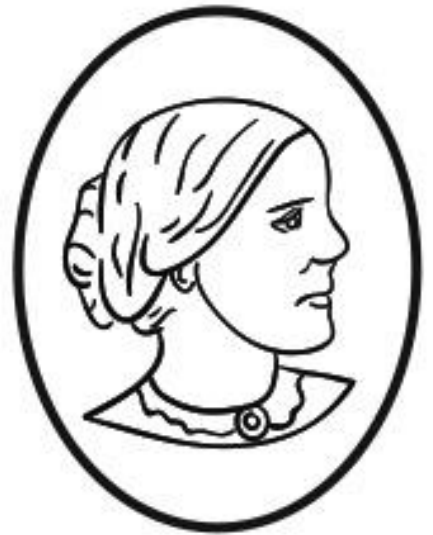
Susan B. Anthony